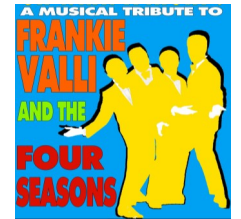
Oh! What A Night!